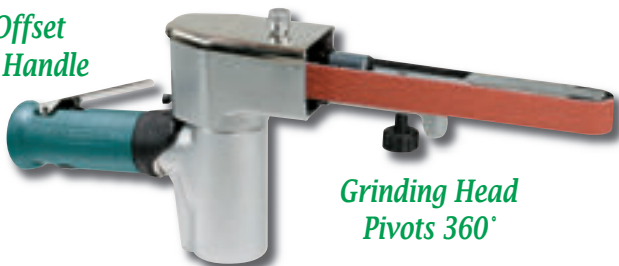
Grinding Head Pivots 360°