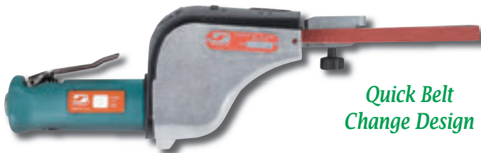
Quick Belt Change Design