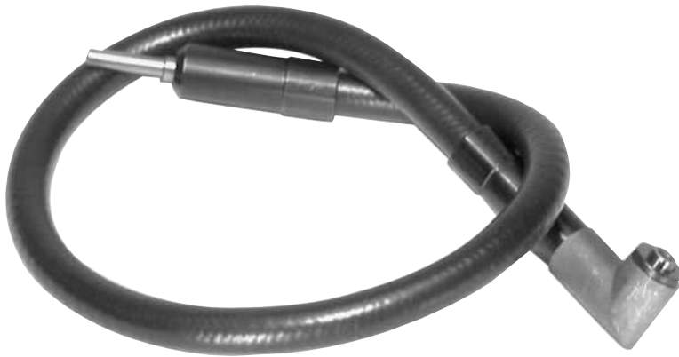
No. 20-128-4S (1/4-28)

Note: Angle Head (1) and Retainer Bearing (7) are removed by turning right hand.