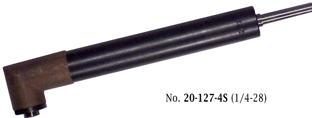
No. 20-127-4S (1/4-28)

Note: Angle Head (1) and Retainer Bearing (7) are removed by turning right hand.